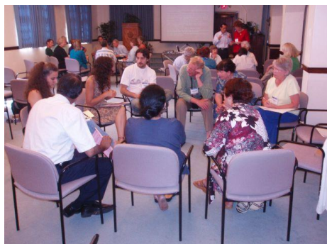
Group discussions on vision, needs & plans