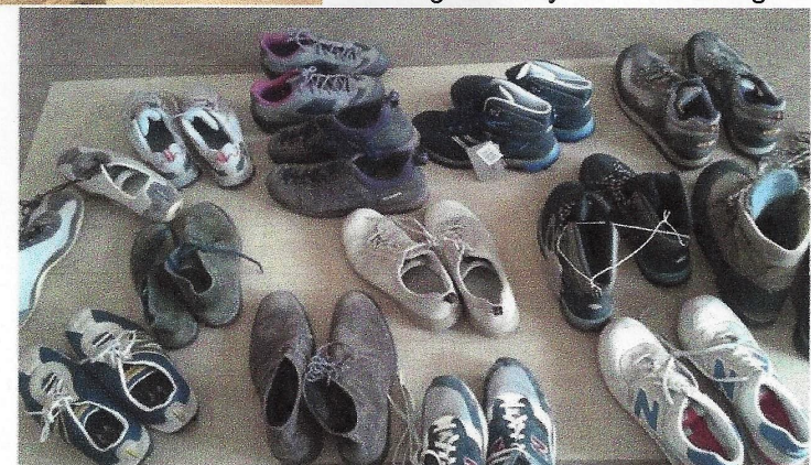
The TOS Italy has been actively helping Syrian refugees by sending clothes, food, medicines, shoes, toys and tents for the winter to immigrants on their way from Asia to Europe.

to be sent directly to those affected populations. The war has since escalated and in September 2015 a human flood got to Europe via the Balkan route and the Italian coast: thousands of desperate men, of women with very young children, of elderly, of disabled with no shoes or shelter from cold. In those tragic days we made friends with Gaetano Feras Turrini and Garabawy, founders of the charity 'Speranza-Hope for Children', and we started working actively in fundraising and