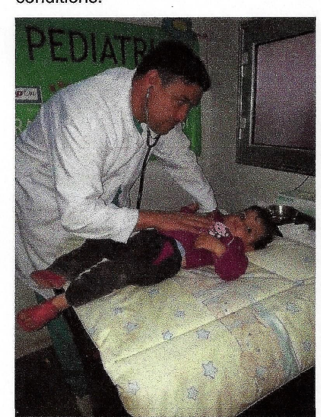
TOS Italy fundraises to support a paediatric clinic at the Bab al Salam refugee camp.

outside in the Turkish town of Kilis. There are a lot of them, and they live in unbearable conditions.