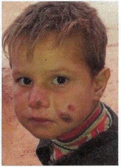
The clinic treats Leishmaniosis disease which affects Syrian children who live in bad conditions due to the

In December, representatives from TOS Italy are very likely to go to Belgrade temporary camp, to distribute meals to migrants, and bring all the aid that we will be able to collect in the meantime.